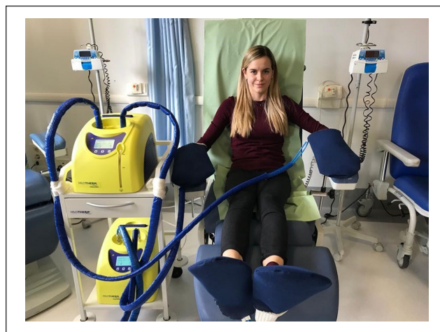
Figure 1. The Hilotherm device.

The patients were treated with different intravenous chemotherapy schedules: weekly PTX (80 mg/m 2 ) for 12 cycles following standard anthracycline-based chemotherapy for breast cancer; 3-week PTX (175–225 mg/m 2 ) plus carboplatin for 6 cycles for gynecological cancer; and weekly nab-PTX (125 mg/m 2 ) plus gemcitabine (on days 1, 8, and 15 of each 28 days) for a maximum of 6 cycles for pancreatic cancer. During every cycle of chemotherapy, premedication drugs (corticosteroids, H1-antagonist/H2-antagonist, and antiemetics) were administered 30 minutes prior to PTX infusion. A total of 80 mg/m 2 PTX per week was administered as a 1-hour infusion; 175 to 225 mg/m 2 of PTX was administered in 3-hour infusion followed by carboplatin; and 125 mg/m 2 nab-PTX was administered over a 30- to 40-minute cycle followed by gemcitabine (infused over 30–40 minutes).